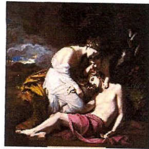
Benjamin West, Venus Lamenting the Death of Adonis , 1768, retouched 1819

Benjamin West's " Venus Lamenting the Death of Adonis " sold at auction in 1819, having already seen a succession of five owners. West undertook restoration of the work for the new owner, trimming the sides and repainting parts to counter the damage caused by years of mishandling and poor storage.